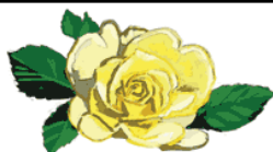
In Our Prayers